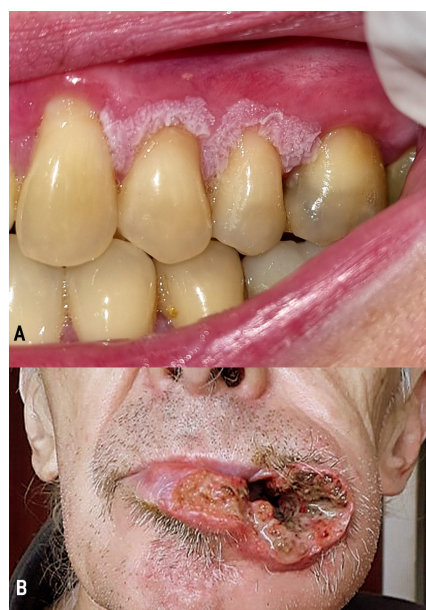
Figure 2. Cases recorded during clinical activity. (A) Verrucous Leukoplakia was diagnosed in a rural worker from the town of Esquel in the context of a clinical examination of the general population; (B) photograph sent to the telemedicine network 25 days after its creation: The patient who lived 450 km from Comodoro Rivadavia's Hospital where the telemedicine network was coordinated. The quick referral to the oral medicine service allowed the histopathological diagnosis of a lip squamous cell carcinoma. The patient revealed that the lesion persisted for two years

During the activity, a total of 148 professionals were trained in the topics covered in the “Training” section, focusing on telemedicine and its role in optimizing the referral process. Among them, 54 non-dentist healthcare professionals received training, including radiologists, dermatologists, oncologists, physicians, nurses, kinesiologists, nutritionists, dental technicians, medical students, and surgeons.